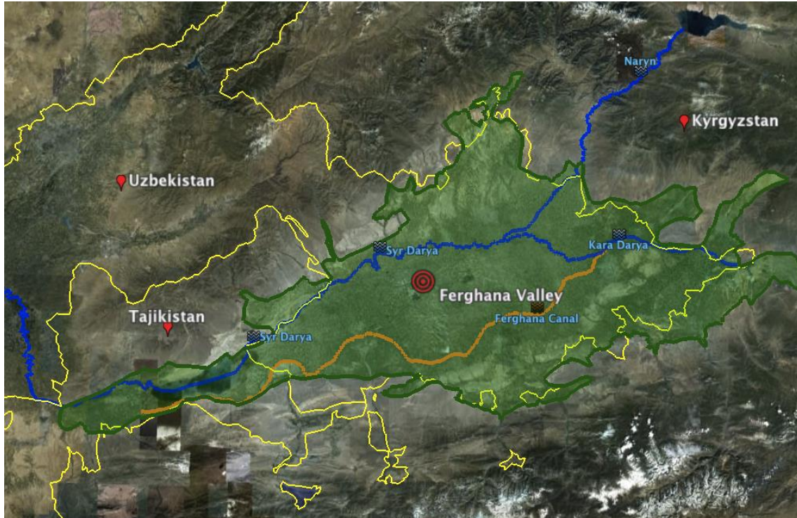
Map 2, Map of Fergana Valley, which indicates the existing enclaves 2

The list of ethnic violence and conflicts in Fergana valley can be quite long. In addition, Fergana Valley accommodates all seven existing enclaves of three Central Asian countries which retain the ethnic tension and violence.