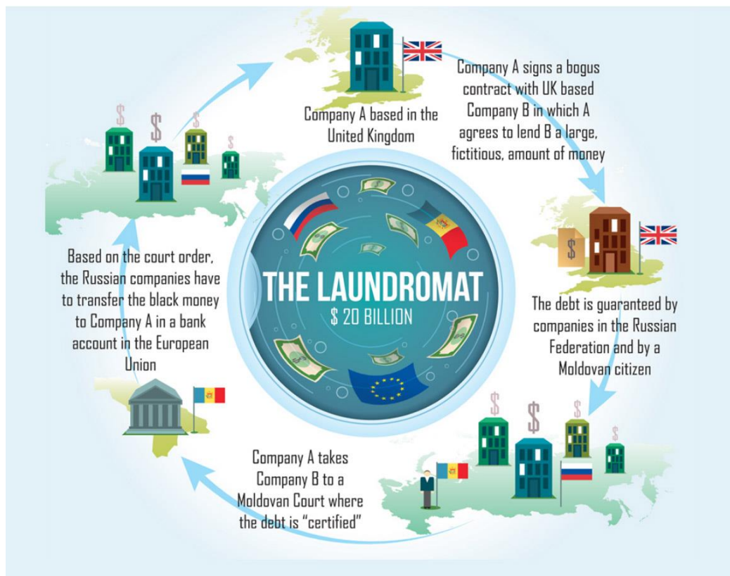
Figure 1: The Laundromat flow of money.

Developing countries have shown increased vulnerabilities to money laundering due to high corruption and poor institutional processes and controls in state institutions. Between 2010 and 2014, Moldova was involved in the “Laundromat”, an international scheme where ill-gotten money was transferred from the Russian Federation to the US and to European countries with the help of on more than 50 court decisions in Moldova. A thorough analysis of the case was done in 2014 by Rise Moldova, a community of investigate journalists. Rise Moldova has revealed the money laundering scheme and the role judges played in it. (figure 1).